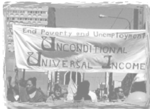
A UUI Banner, at the Hikoī of Hope, 1998 Wellington, NZ

Any economic model meeting human rights standards--such as some proposals representing Basic Income, Social Wage, Social Credit, Guaranteed Annual Income, Universal Basic Income and Unconditional Universal Income (UUI)--is a type of Universal Income.