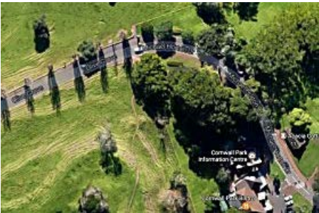
Car crashes in over bank and into tree at Auckland's Cornwall...