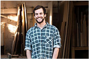
Reducing Paperwork for Sole Traders Xero

Get the news delivered straight to your inbox Receive the day's news, sport and entertainment in our daily email newsletter