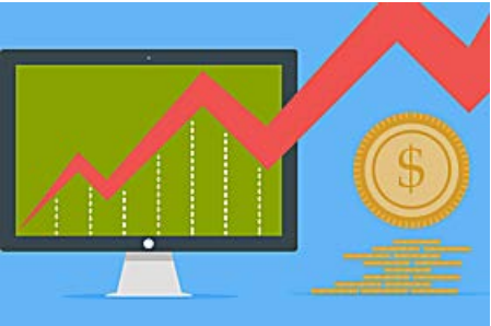
Say Goodbye to Your Spreadsheet – It's the Age of the... GetApp.com