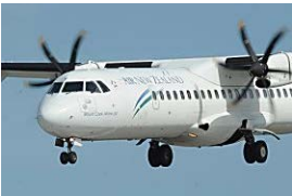
Flight turned back after bird strike