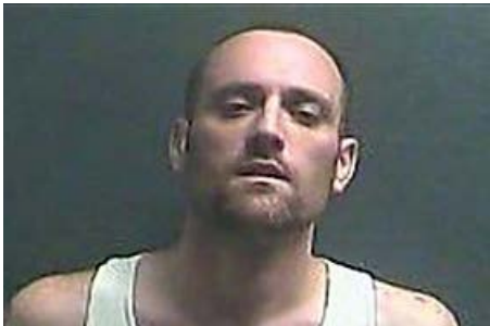
Man sentenced for scalping his girlfriend tells judge to skip the...