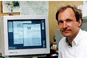
Dire warning from internet visionary