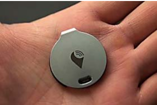
Car Thieves Will Hate This Tiny Device Techie Fans