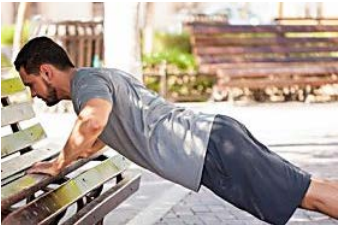
3 Steps To Burn Off Stomach Fat After 40 MAX Workouts